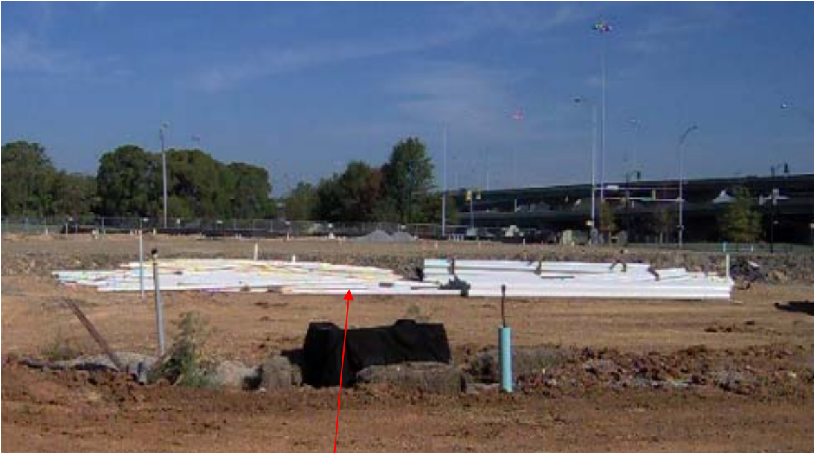
PVC Piping for Underslab Utilities