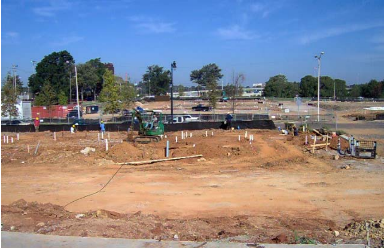
BLOCK 'E' – BUILDING 8 Digging Perimeter Trenches for Flowable Fill