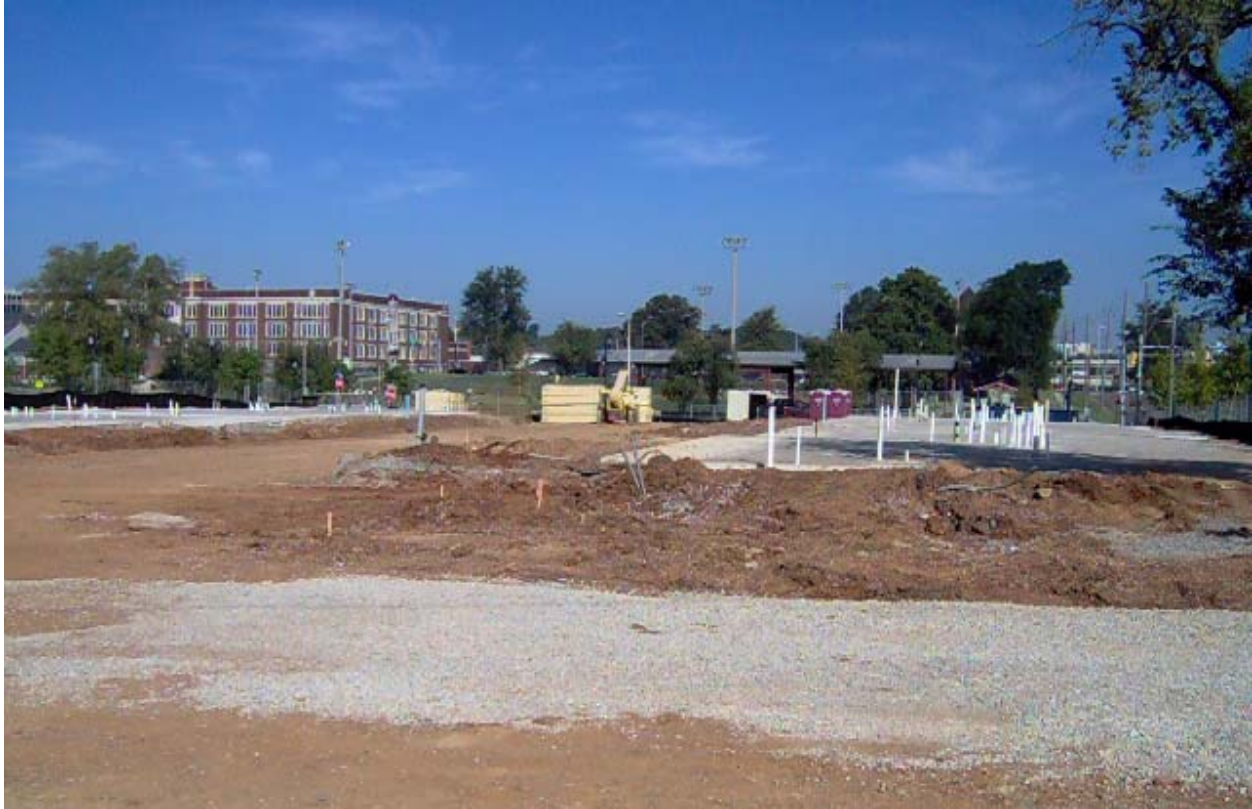
BLOCK 'F' EAST – BUILDINGS 2 & 3 Poured Slabs w/ Lumber for Framing Stacked on Site