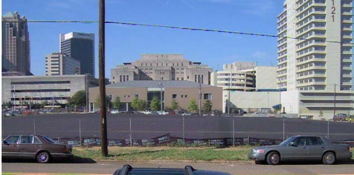
Southern Portion Asphalted for Parking Lot for Park Place Phases I & II