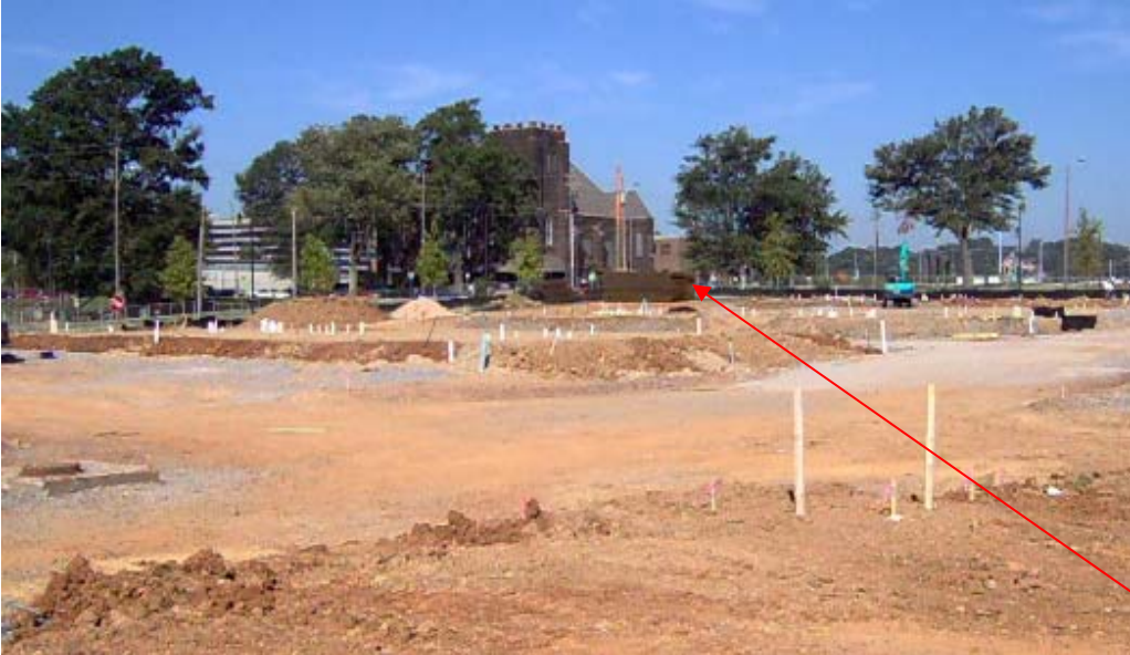
Welded Wire Mesh for Slabs Stored on Site