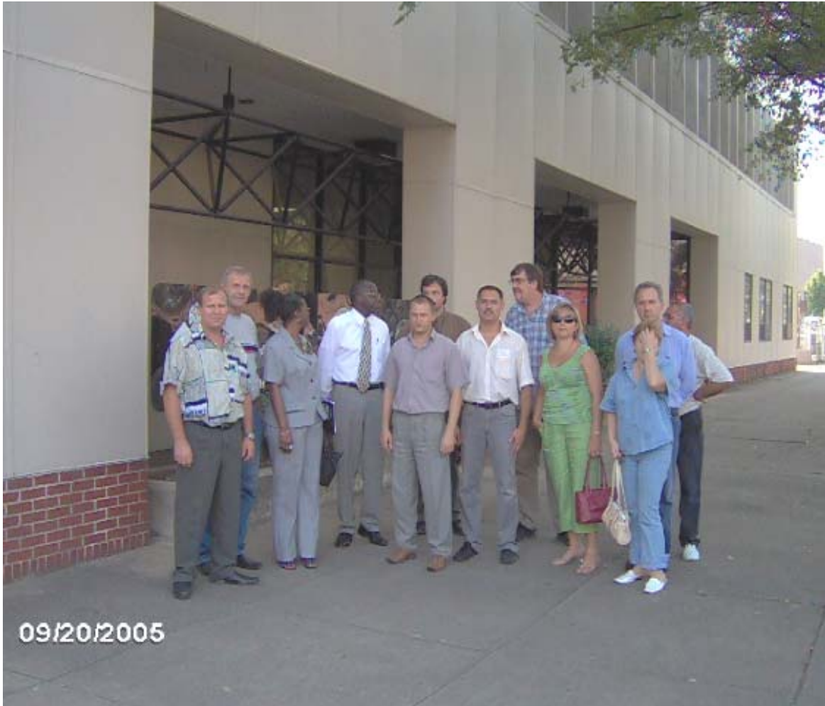
CITY OF BIRMINGHAM / UKRAINE OFFICIALS DELEGATION w/ HABD and PMT Staff after touring Park Place and Smithfield