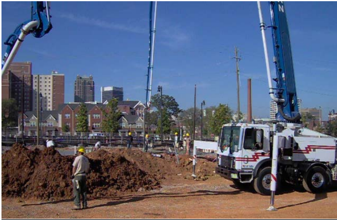
BLOCK 'E' – BUILDING 4 Slab Pour in Progress